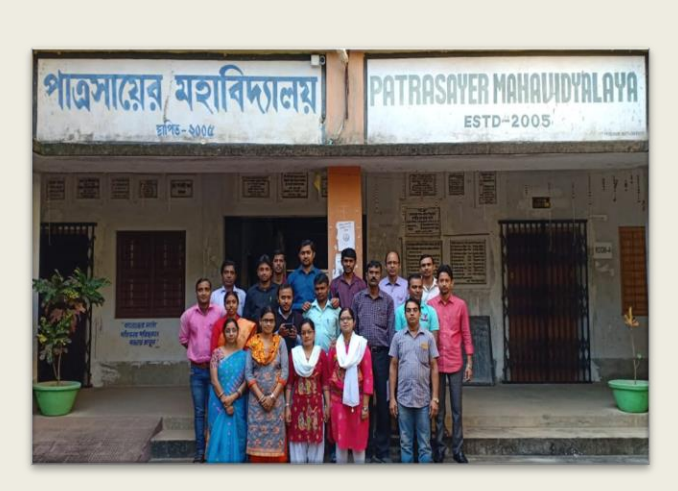
Teaching and Non-Teaching Staff at Patrasayer Mahavidyalaya