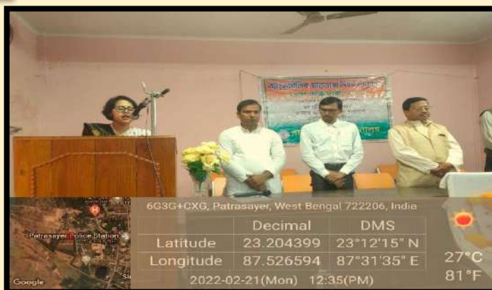
'Matri Bhasha Divas' or International Mother Language Day Celebration.

For Online Admission, visit: http://patrasayermahavidyalaya.in/