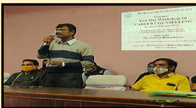
Two-Day Career Counselling Session held at college Seminar hall.