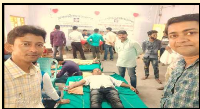
Voluntary Blood Donation Camp conducted by NSS Unit, Patrasayer Mahavidyalaya.