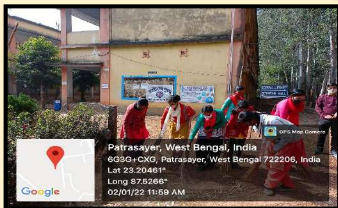
Campus Cleaning Drive organized by NSS Unit of Patrasayer Mahavidyalaya.