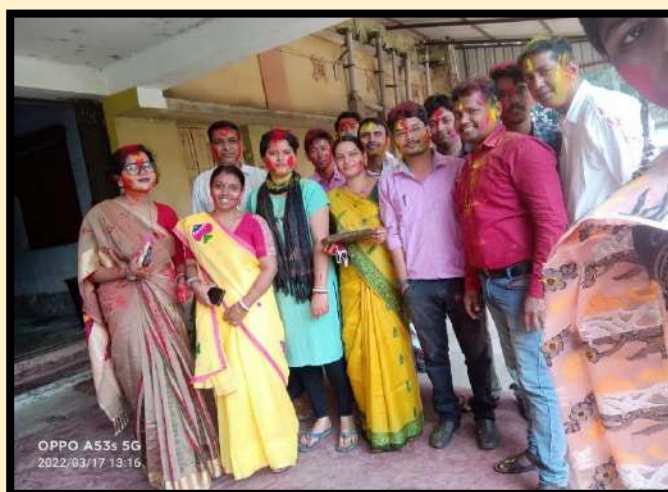
'Basanta Utsav' celebration with student and staff at college Seminar Hall.