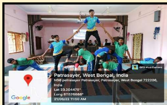
World Yoga Day celebration organized jointly by the NSS Unit and the Department of Physical Education, Patrasayer Mahavidyalaya.

For Online Admission, visit: http://patrasayermahavidyalaya.in/