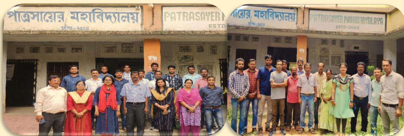
Teaching and Non-Teaching Staff

For Online Admission, visit: http://patrasayermahavidyalaya.in/