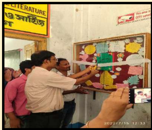
Inauguration of Wall Magazine Dept. Of Bengali