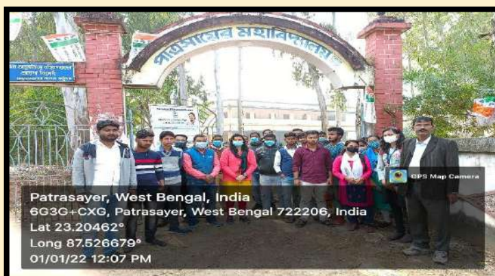
Students' Week Observation at college campus.