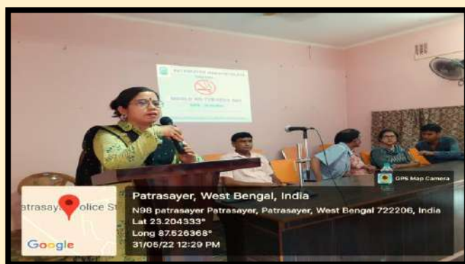
International / World No-Tobacco Day observed at college Seminar Hall.