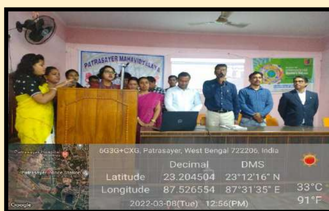
Celebration of International Women's day with Special Invitee, Lady Police Constable of Patrasayer Thana.