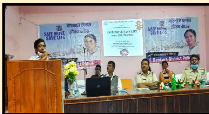
'Safe Drive, Save life' Awareness Programme Conducted by Patrasayer Police Station at college Seminar Hall.