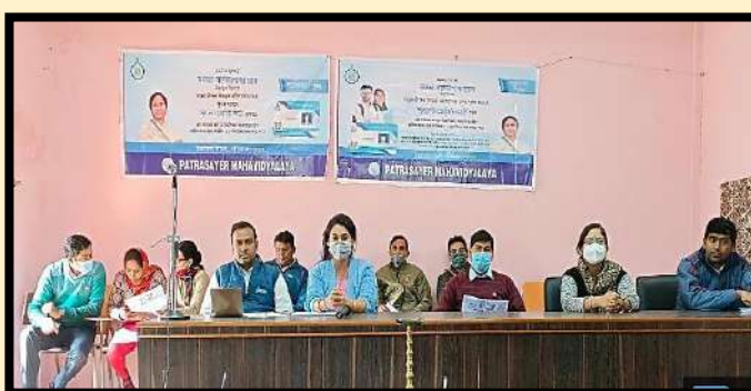
WB Student Credit Card Awareness Camp held at college Seminar hall.