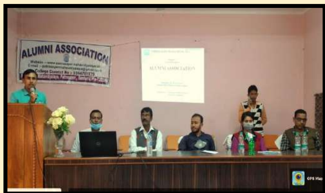
Alumni Association Meeting Organised by College Alumni Association.