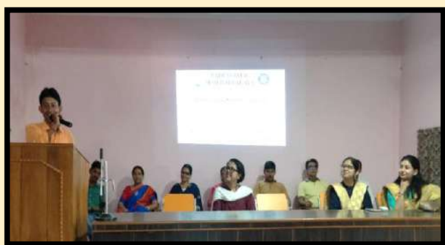
One day Seminar on “The Importance of Women Participation in NSS” conducted by the NSS Unit, Patrasayer Mahavidyalaya.